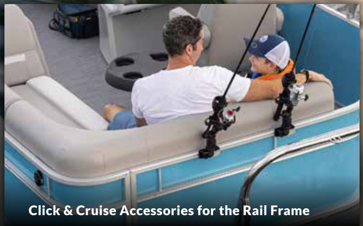
Click & Cruise Accessories for the Rail Frame

The Godfrey Pontoon Boats refreshed Monaco series now blends sleek design with versatile layouts, powerful engine options, and luxury finishes. The new Seaview™ Gate enhances the open-water experience, while the Click & Cruise rail system makes customization effortless with various options.